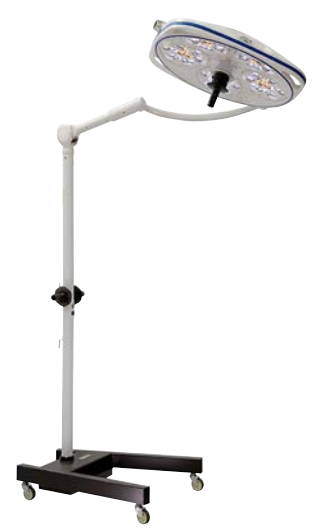
Also available on a mobile stand