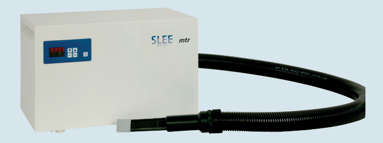
MTR Bench top quickfreezing unit