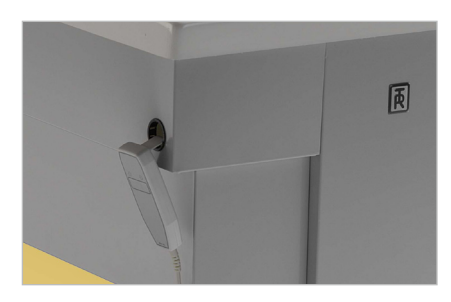
The height adjustment of the TR 1700 is controlled by a hand control that can be operated from either side of the bathtub.

Fax: +46 140-38 50 61 Fax: +1 847-724-8566 Fax: +44 844 335 8383 Phone: +49 2175-16 94 22-0 Fax: +49 2175-16 94 22-19