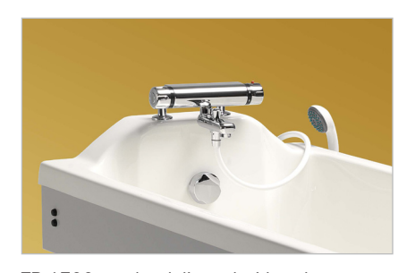
TR 1700 can be delivered with a therostat that controls both the bathtub filling and the shower.